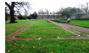
4—Roman Fort site

Dig in 1993. When deposits of lithic material were found (flint, chert, quartz and agate). Following analysis it was determined that these were from 8,500 BC.