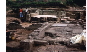
2—The Roman Bathhouse Site

Cramond Heritage Trust Education and Information Centre.