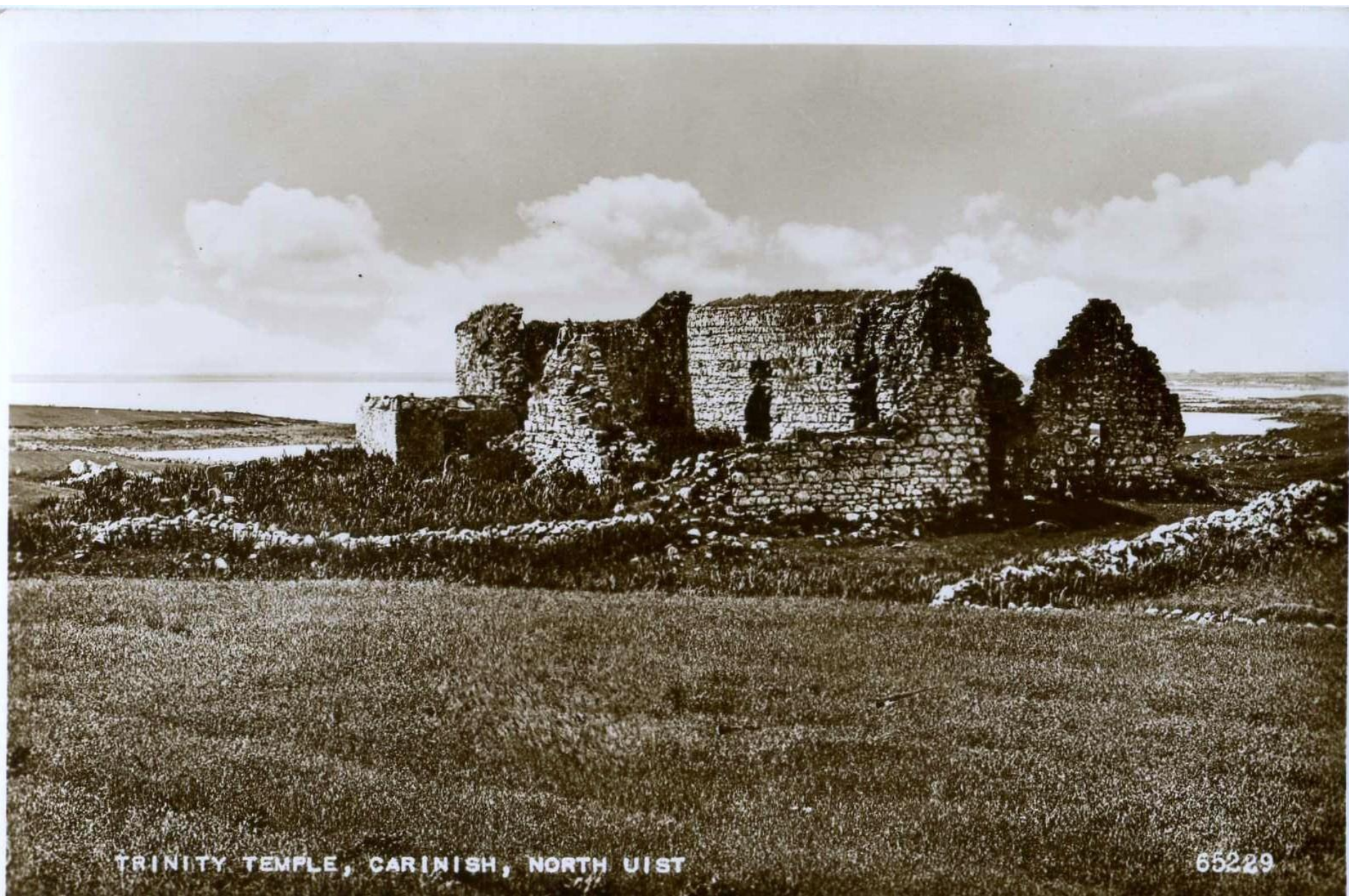
TRINITY TEMPLE, CARINISH, NORTH UIST