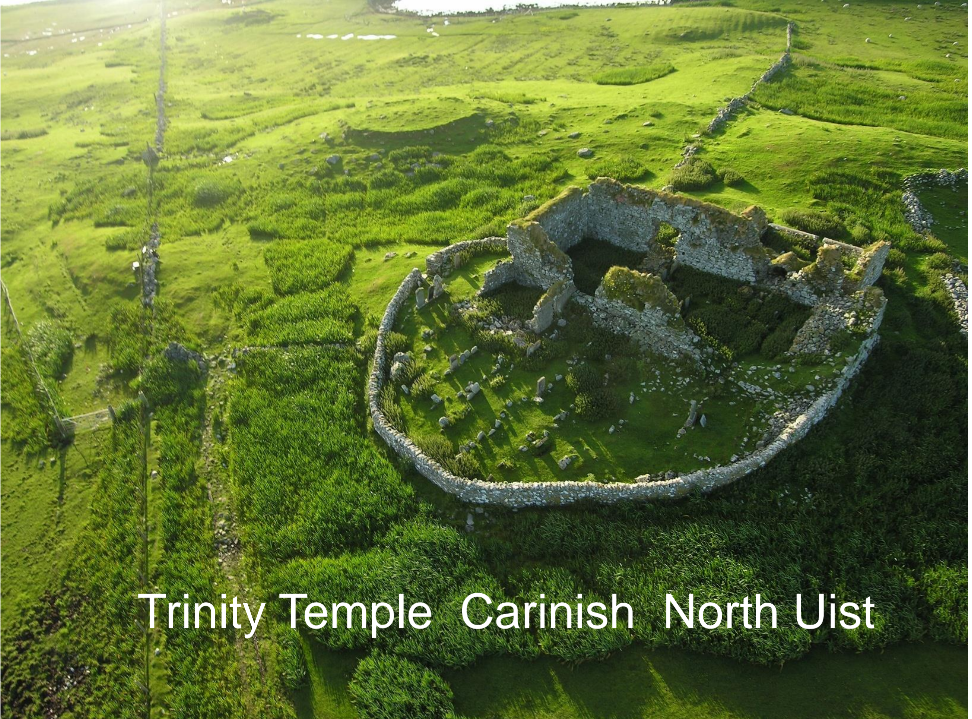
Trinity Temple Carinish North Uist